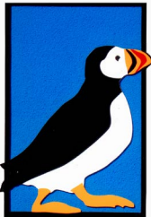
The Puffin Foundation, Ltd.

Education programs in conjunction with Activist New York are made possible by The Puffin Foundation, Ltd.